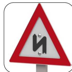
2605 CURVA DOPPIA