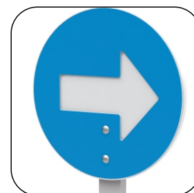
2612 DIREZIONE OBBLIGATORIA