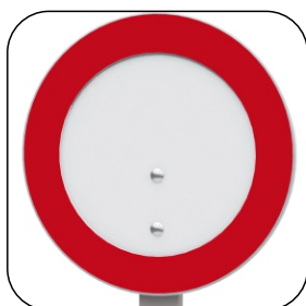
2606 DIVIETO DI TRANSITO