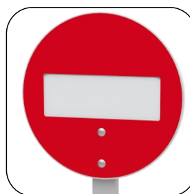
2609 DIVIETO DI ACCESSO