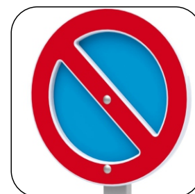
2611 DIVIETO DI SOSTA